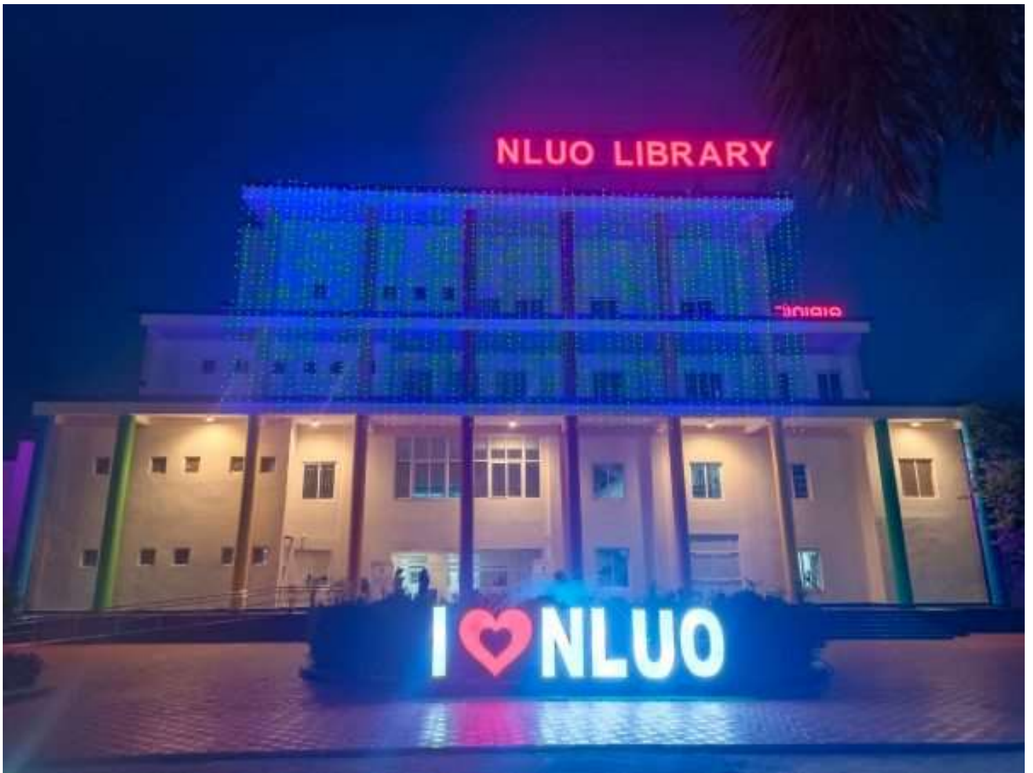
National Law University Library Building 420HP,Cuttack

At PACS, we don't just complete projects; we elevate them to a standard that exceeds expectations. Our adherence to industry standards ensures that every HVAC solution we deliver is not only state-of-the-art but also compliant with the latest regulations and guidelines. As we continue to pioneer excellence in the HVAC sector, our clients can trust that their projects are in the hands of a team dedicated to setting and surpassing the highest standards.